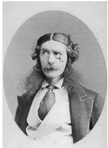
Edward Sothorn as Lord Dundreary, sporting "Dundrearies."