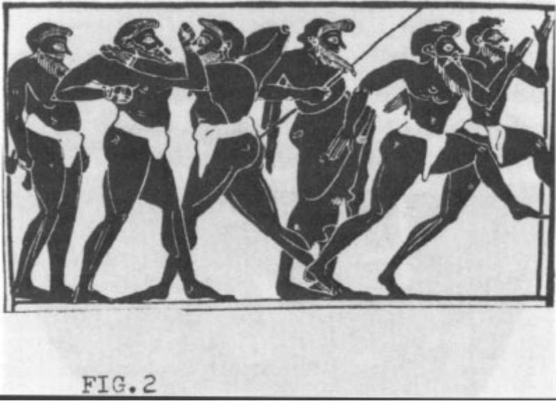
Attic stamnos of the late 6th century, B.C., E. Norman Gardiner, Athletics of the Ancient World (Oxford, University Press, 1930) fig. 182.

undertook to strip and ran naked at Olympia, at the fifteenth Olympiad, was Acanthus the Lacedaemonian. 4