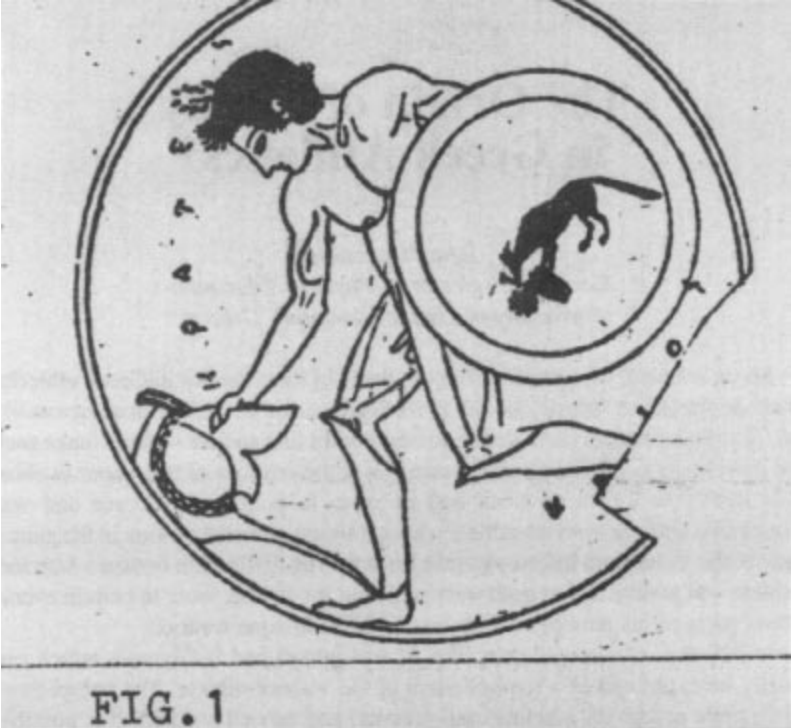
Red-figure Attic Vase. E. Norman Gardiner, "Notes on the Greek Foot Race," JHS 23 (1903) fig. 14.

prompted some scholars to raise the question of reintroduction of loincloths in athletics. 3 This was not an attempt to "reintroduce" but rather to introduce loincloths in the games because prior to these vase representations there is nothing in Greek art to indicate the existence of loincloths in athletics. The alleged change from loincloths to nudity is not illustrated in any Greek art.