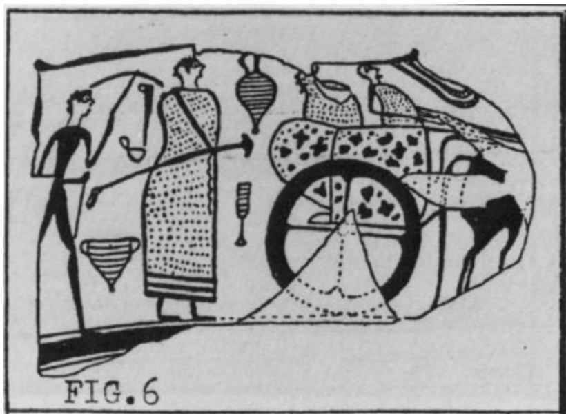
A fragment of Mycenaean chariot krater from Enkomi (c. 1300 B.C.). H. W. Catling and A. Millett, "A study in the Composition Patterns of Mycenaean Pictorial Pottery from Cyprus," BSA 60 (1965) Pl. 58 (2).

confronted with their arms extended (Fig.7). This scene represents a boxing contest possibly at funeral games. Pairs of confronted nude athletes that remind us of the classical boxing scenes form the sole subject of a Mycenaean vase (Fig.8). It has been suggested that the scene depicts confronted boxers. 15