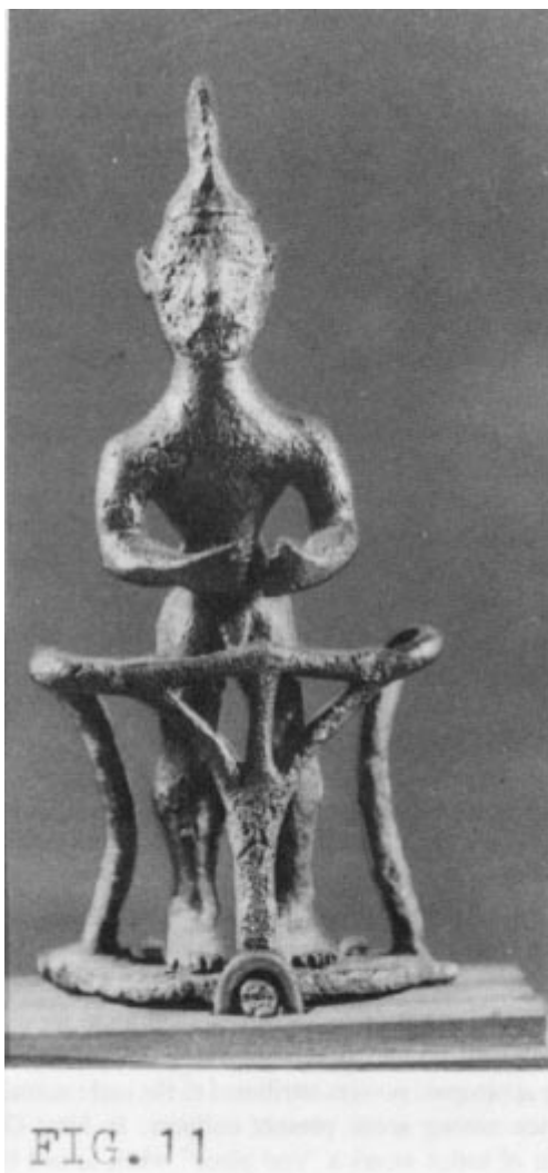
A Geometric bronze statue from Olympia. Nick Stourmaras and Nick Corbetis, eds., Olympia 1971 fig. 3.

cod-piece and the baboon exhibiting his erect penis as an aggressive signal to other baboons to keep off aim at the same effect" (p. 165). The author also notes that tendencies towards genital activity of an aggressive nature are repressed in our present civilization and that today's men are not conscious of potentials like those openly expressed in the Near East and—at least verbally—among the ancient Norsemen. This means, according to the author, that rational understanding of the aggressive aspects of phallic symbolism is lost too; and this in turn indicates that appreciation of the signal function of a phallic symbolism in dominance-submission patterns has vanished from the consciousness—notwithstanding that these patterns still remain unchanged and alert of action below the threshold (p. 191).