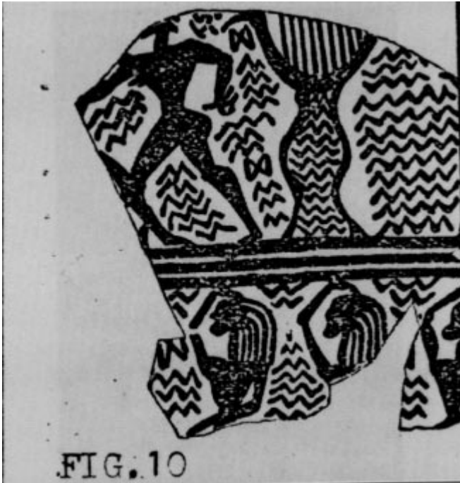
An Argive Geometric shard. Erich Pernice, "Geometrische Vase Aus Athen," Mitteilungen des Deutschen Archäologischen Instituts, Athenische Abteilung 17 (1892) fig. 10.

The Greeks felt so strongly about nudity that it was thought to have a magical effect (c.f. the apotropaic use of the phallos, gestures against the evil eye, etc.). Their athletes were thought to be protected in some way by their nudity. 21