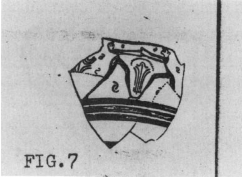
A fragment of Mycenaean krater from Enkomi (c.1300 B.C.). H. W. Catling and A. Millett, "A study in the Composition Patterns of Mycenaean Pictorial Pottery, from Cyprus," BSA 60 (1965) Pl. 58(1) (Courtesy of the Trustees of the British Museum).

shard from the Argive Heraeum represents nude boxers beside a deep tripod. (Fig. 10). A Geometric vase from Boeotia shows two nude boxers or wrestlers trying to win a tripod. 18 A Geometric bronze statue from Olympia represents a nude charioteer with a conical helmet (Fig. 11). Early Proto-Attic and Proto-Corinthian vases also depict nude athletes. On a Proto-Attic vase (Fig. 12) we clearly see two nude wrestlers, 19 while an early Proto-Corinthian aryballos from Ithaca represents two nude boxers beside a tripod. 20