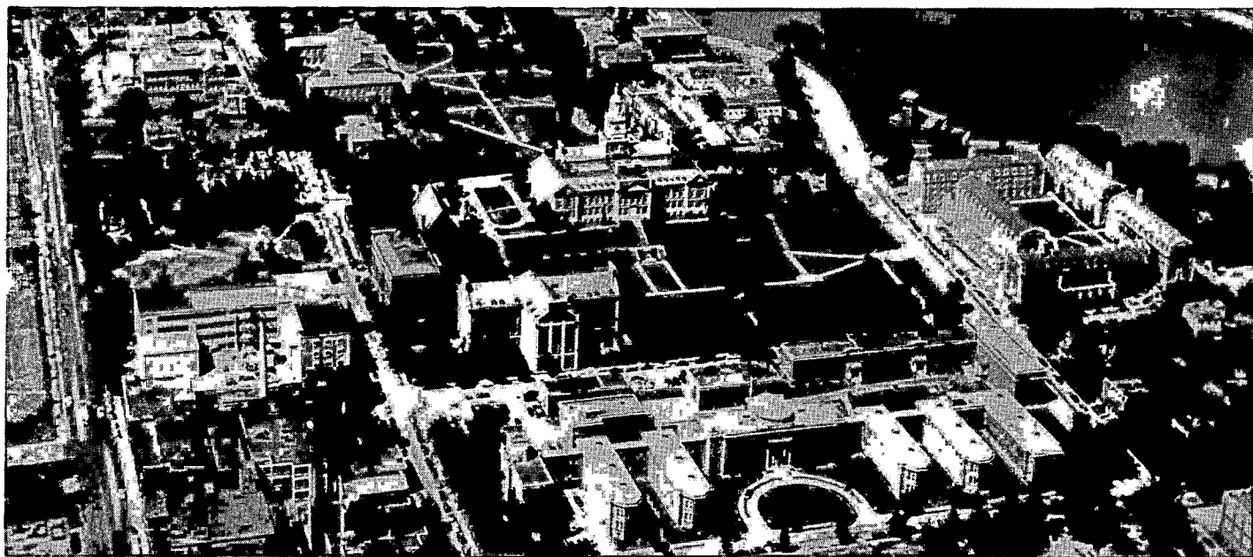
ABOVE is an aerial view of Howard College.